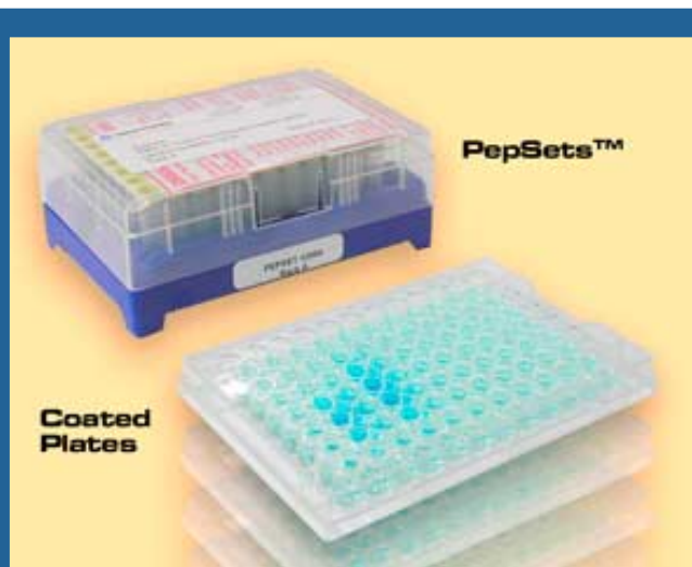
Figure 2: A packaged PepSets peptide library with coated plates

T-cell epitopes (Helper and Cytotoxic) are easily located using PepSets provided peptides of the correct length are used 2 . This application is summarized in a separate article entitled Truncated Peptide Libraries for Cytotoxic T-Cell Epitope Mapping , available on the Mimotopes website. When a bioactive sequence is already known, analoging studies can be carried out using the set of peptides comprising single-point substitution sequences, or a combination of 2 or more selected substitutions. Sequences exhibiting enhanced bioactivity, or inhibitory properties, are candidates for development as peptide or peptidomimetic drugs.